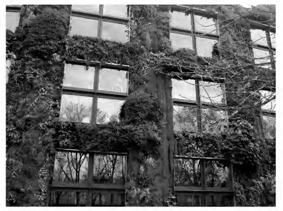
Musée du Quai Branly.

As Old Saint Nick may once have said "Ho, ho, ho, I've never seen so many weeds!" Yes, we returned (energized) from the Paris climate talks, to find that the rain, sun, and soil had unlocked the life force of the mallow, hairy crab grass, radish, oxalis, and numerous recognized but unnamed visitors from faraway lands (maybe they came attached to the reindeer hooves?). As usual, the Pt. Isabel restoration stewards and volunteers donned their gloves, picked up their soil knives and set to work removing the weeds from in and around the